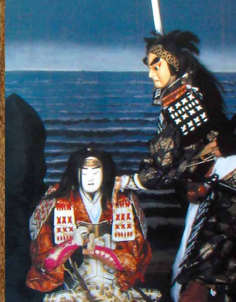
Ichinotani futaba gunki (Chronicle of the battle of Ichinotani valley) A tragedy of samurai warriors