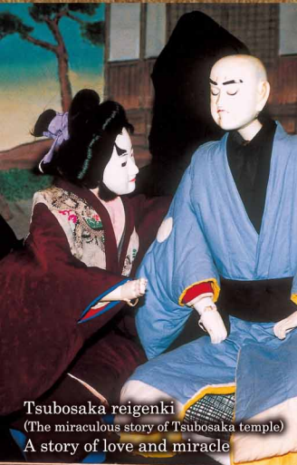
Tsubosaka reigenki (The miraculous story of Tsubosaka temple) A story of love and miracle