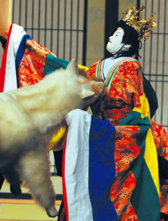
Tamamonomae asahi no tamoto (Brilliant sleeves of Lady Tamamonomae) A story of evil fox and sorcerer