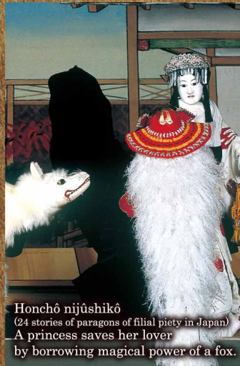
Honchō nijūshikō (24 stories of paragons of filial piety in Japan) A princess saves her lover by borrowing magical power of a fox.