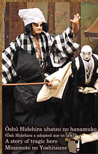
Ōshū Hidehira uhatsu no hanamuko (Ōsh Hidehira s adopted son-in-law) A story of tragic hero Minamoto no Yoshitsune