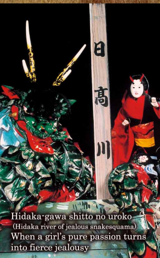
Hidaka-gawa shitto no uroko (Hidaka river of jealous snakesquama) When a girl's pure passion turns into fierce jealousy